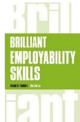
Trought, Brilliant Employability Skills

For any queries about Kick-Start or your order, please see here: